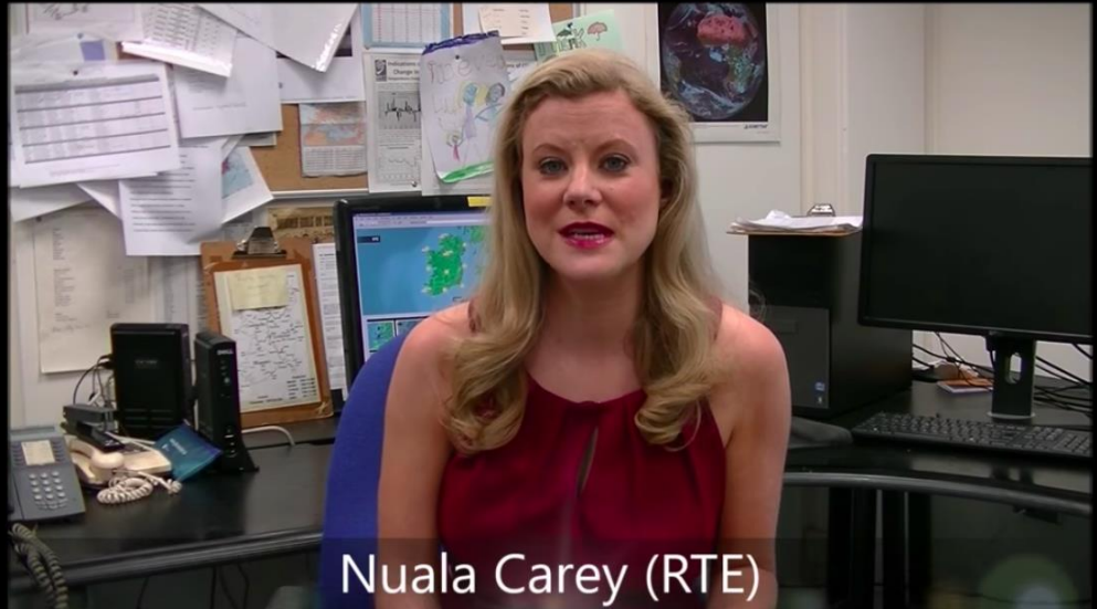
Ambassador for National Carers Week