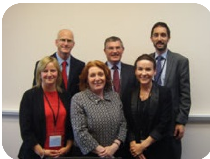
Minister Kathleen Lynch meeting with representatives from Care Alliance Ireland and the Carers Association

Considerable progress has been made in recent months in advancing the implementation of the Strategy. Members of the Monitoring Group met with Minister Kathleen Lynch and her colleagues from the Department of Health on 10 June and are greatly encouraged by the positive approach of the Minister and particularly her commitment to ensure that the national goals, objectives and actions contained within the Strategy are delivered through meaningful and positive engagement with the Monitoring Group. Meetings have recently taken place with the Department of Social Protection, the Department of Health/HSE, and the Department of the Environment, Community and Local Government. Further meetings with other key departments and agencies are being scheduled to discuss implementation of their assigned actions.