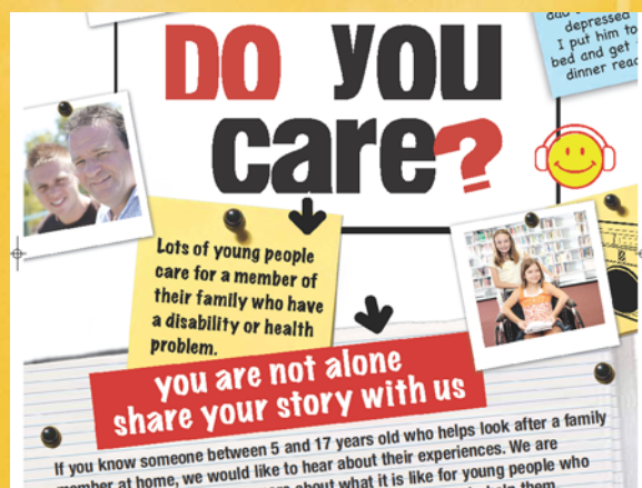
Poster Used in Nationwide Information Campaign